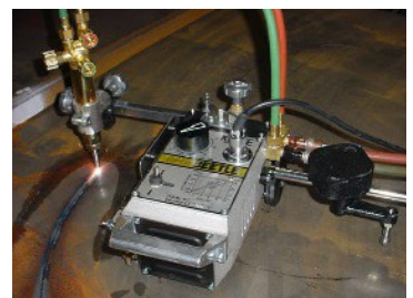
Circle cutting attachment